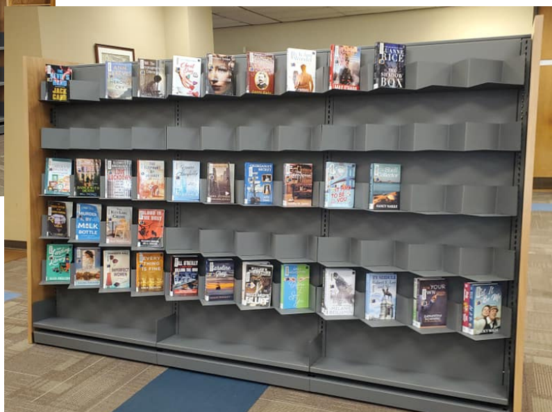
New Shelves for New Large Type