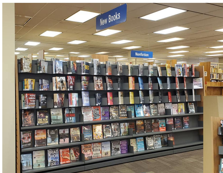
New Shelves for New Adult Fiction/Nonfiction