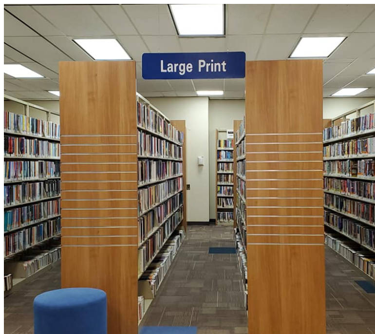
New Shelf End Panels