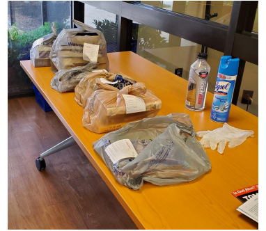
Patron orders ready for pickup