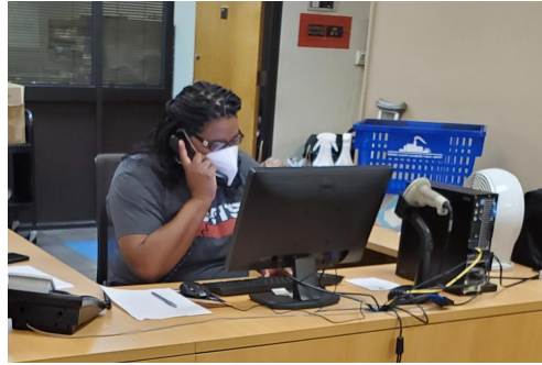
Processing email/phone requests